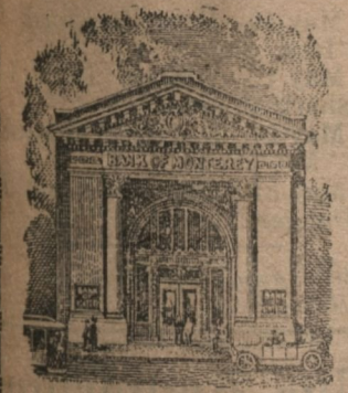
Bank of Monterey Monterey Sav. Bank Same BUILDING MANAGEMENT

Notes mature May 20, 1923. May be redeemed at the option of the United States on June 15th or Dec. 15th, 1922.