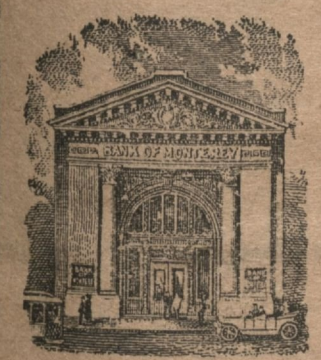
Bank of Monterey Monterey Sav. Bank Same BUILDING MANAGEMENT

Are you doing business as other progressive men are? If you have not a bank account you are behind the age. Better open one at once.